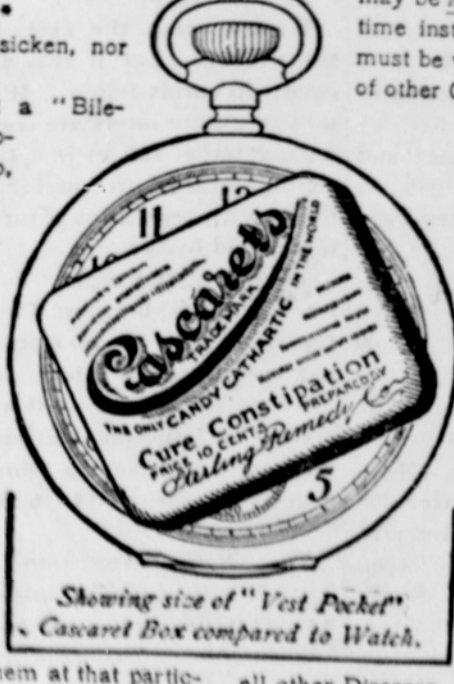
Showing size of "Vest Pocket" Cascarets Box compared to Watch.

FREE TO OUR FRIENDS! We want to send to our friends a beautiful French-designed GOLD-PLATED BONBON BOX hard-enamelled in colors. It is a beauty for the dressing table. Ten cents in stamps is asked as a measure of good faith, and to cover cost of Cascarets with which this dainty trinket is loaded. Send to-day, mentioning this paper. Address Sterling Remedy Company, Chicago or New York.