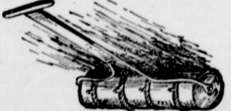
ROLLER AND MARKER COMBINED.

A neat attachment to a garden roller is the following: Bore holes eight inches apart lengthwise and put in