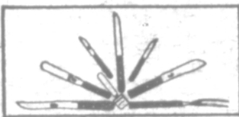
$7.50 Knife Set FREE

Choose any range you need, from the 3-burner model for small homes at $83.50, to the wonderful DeLuxe model with every possible accessory and convenience—then pay us only $5 now. The balance is on easy terms. Come in and see just which range will best "fill the bill" for you. Then we can talk over the arrangements.