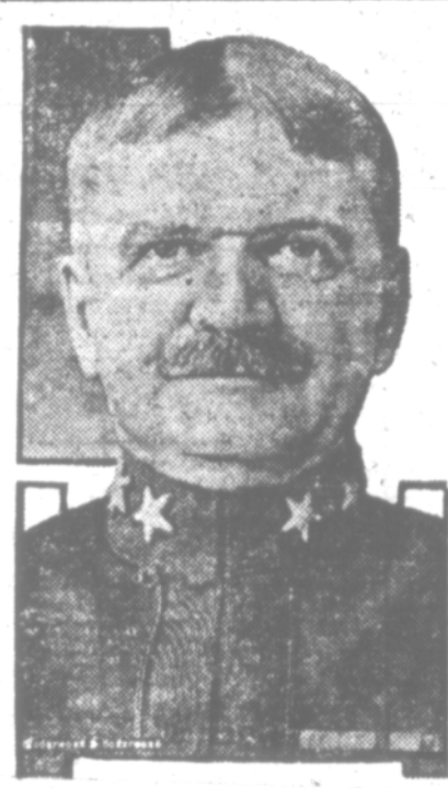
Admiral Coontz, who is in command of the maneuvers of the United States fleet in the Pacific.