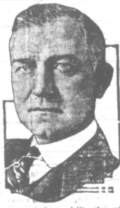
Robert D. Carey of Wyoming, who was named by President Coolidge chairman of the commission to devise relief for the farmer.