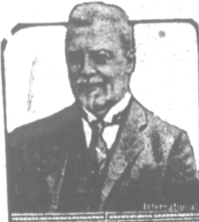
Dr. Hugo Eckener, the German Zeppelin expert, who was in charge of the ZR-3 in its flight across the Atlantic.

House Committee Kills Gooding Bill. Washington, D. C. — The Gooding long and short haul bill, over which Pacific coast and western intermountain interests have struggled for many months, was put to death in the house committee on interstate and foreign commerce. The vote was 11 to 6.