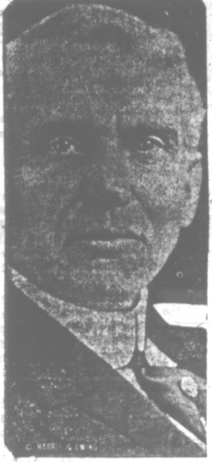
Frank B. Kellogg, former senator from Minnesota and present ambassador to Great Britain, who has been named secretary of state.