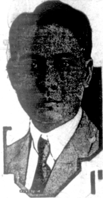
Manuel Roxas, speaker of the Philippine house of representatives, who is in Washington, D. C., to present the Filipino side of the controversy with General Wood.