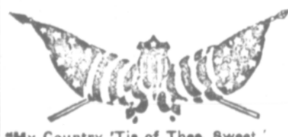
"My Country 'Tis of Thee, Sweet of Liberty."