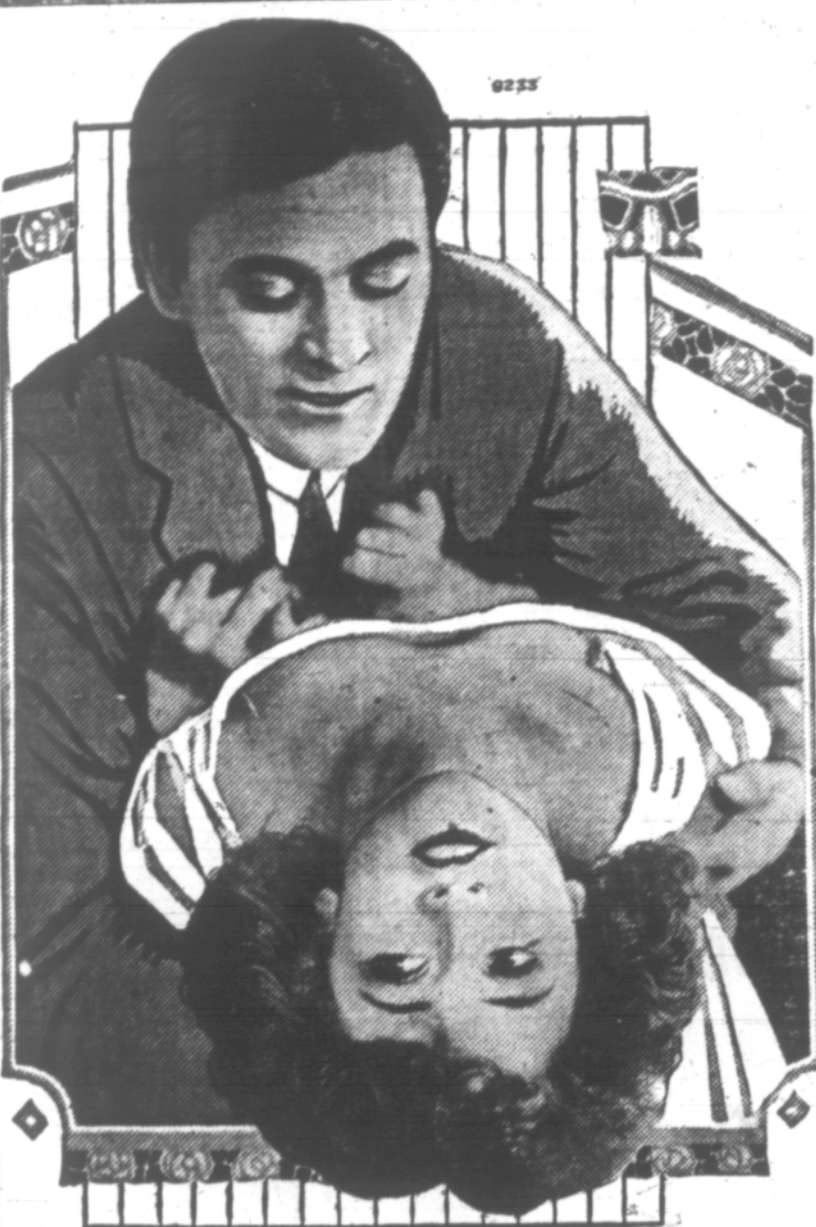
THOMAS MEIGHAN and BETTY COMPSON in George Loane Tucker's 'The Miracle Man' A Paramount Aircraft Picture