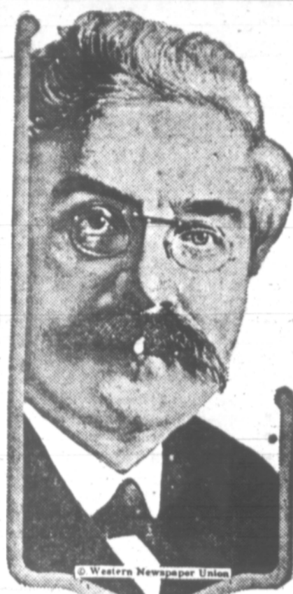
Alexandre Millerand, governor of Alsace-Lorraine, who was elected Presi- dent of France, to succeed President Poincare.