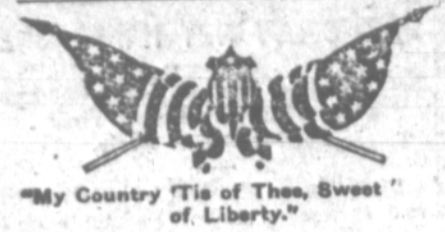
"My Country 'Tis of Thee, Sweet of Liberty."