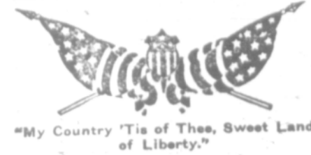
"My Country 'Tis of Thee, Sweet Land of Liberty."

We will not be responsible for the neglect of subscribers to notify as of changes in their address. Nor will the notification of a Postmaster that the subscriber has "Removed" settle the bill of a delinquent.