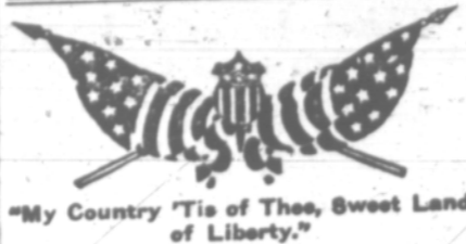
"My Country 'Tis of Thee, Sweet Land of Liberty."