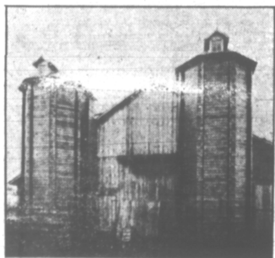
Sizes 500 to 3000 Bushels

The Monro Perfect Grain Bin will be on exhibition Kent, Saturday, March 30th Grass Valley, Thursday, April 4th Moro, Saturday, April 5th