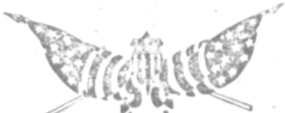
"My Country 'Tis of Thee, Sweet Land of Liberty."

We will not be responsible for the neglect of subscribers to notify as of changes in their address. Nor will the notification of a Postmaster that the subscriber has "Removed" settle the bill of a delinquent.