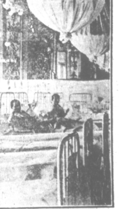
Wounded soldiers. Photo shows the interior of the great ballroom and royal hall.

The Quirinal, famous royal Italian palace, transformed into a hospital for wounded soldiers. Photo shows the interior of the great ballroom and royal hall.