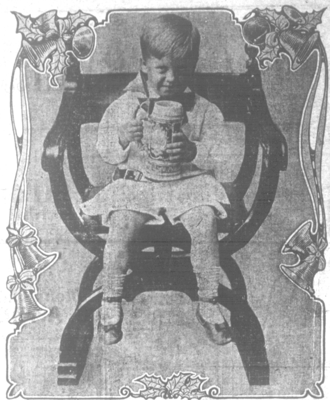
"HERE'S WISHING YOU A HAPPY NEW YEAR!"