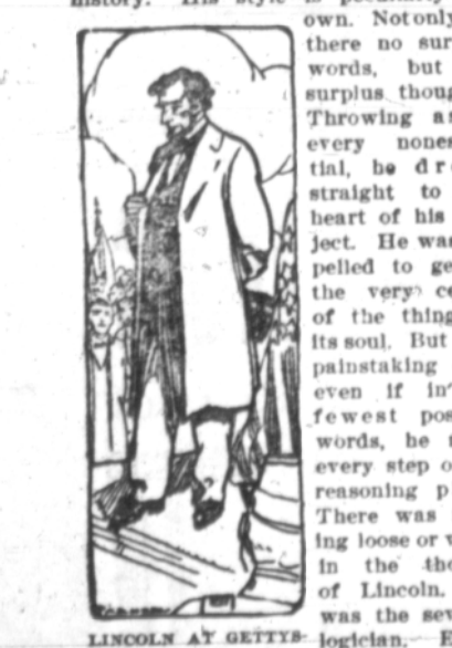
LINCOLN AT GETTYSBURG.

The most famous addresses of Mr. Lincoln were perhaps those on the "Bloomington" and the "lost speech," the debates with Douglas, the Cooper Union speech, the two inaugural addresses and the Gettysburg address.