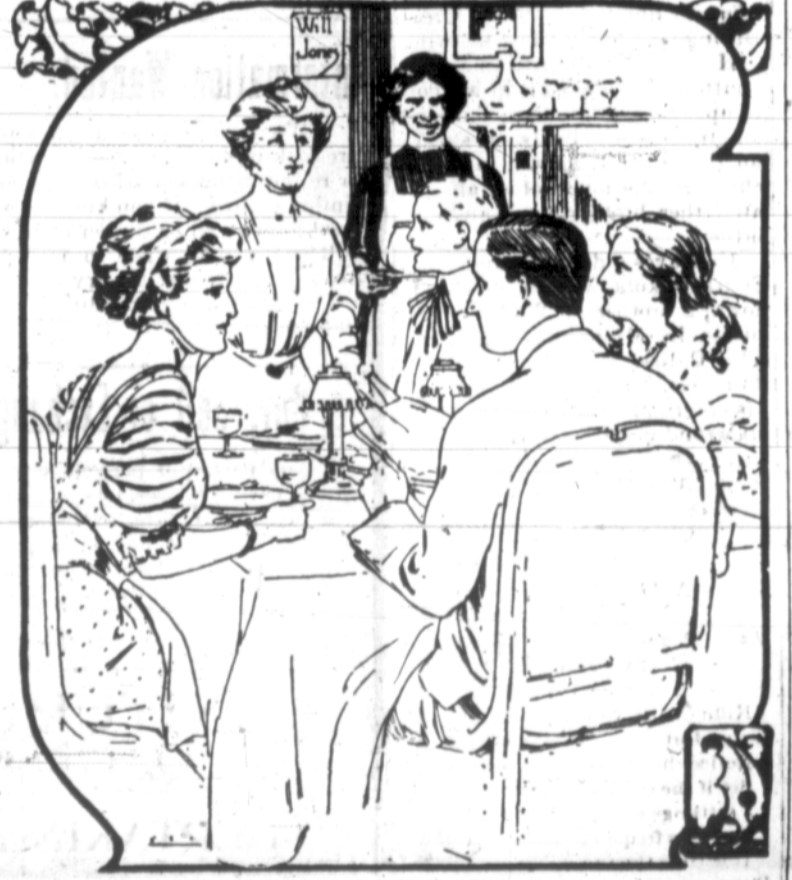
"WE'RE GOING TO A RESTAURANT FOR A REAL CHRISTMAS DINNER."

I am sorry, I am sorry, that you have entered into a movement to obtain the vote for women. Ten years ago I took part in a movement with that object in view, and it turned out a lamentable failure.