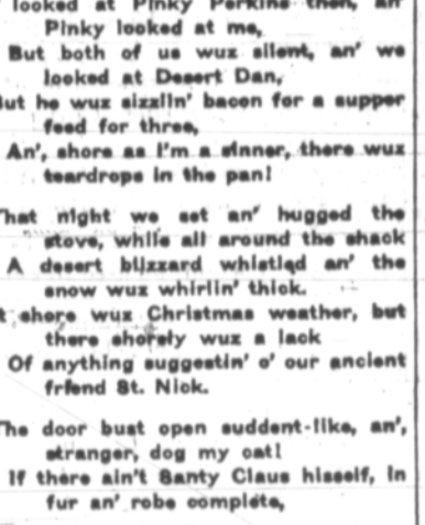
"I'VE BEEN AIN'T SARTY CLAUZ HINSELF."

this outbreak, and toward afternoon the mock turkey made its appearance. It resembled a gigantic candy favor in shape and color. The titling of the outside had been rudely done and by no means suggested the crackling skin of the barnyard king bursting from the pressure of the rich juices within.