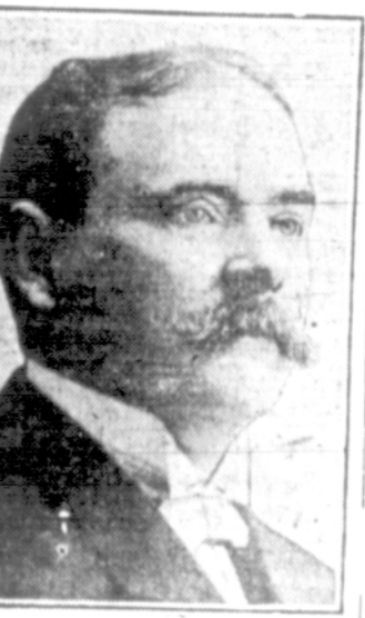
WILLIAM J. BRYAN.

When William J. Bryan was first nominated for the presidency at Chicago in 1896 he was but thirty-six years old and in the campaign which followed was often called the "boy orator of the Platte." That was twelve years ago, and now that he is running for the presidency a third time he is still in the full vigor of manhood, but he is getting baldheaded and is a grandpa. There will not be