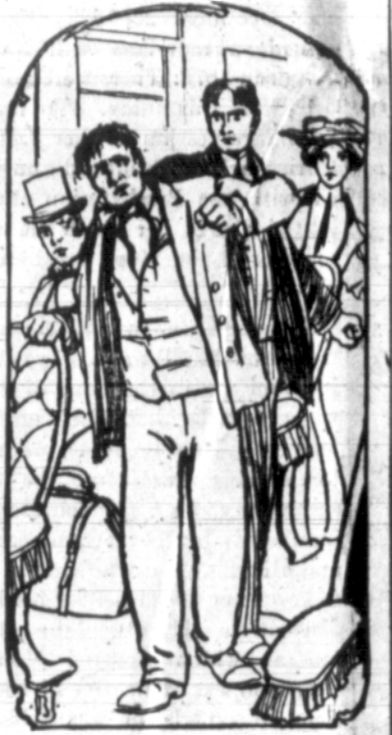
TOOK THE DISTURBER BY THE NECK AND DRAGGED HIM INTO THE SMOKE.

It was an interstate contest and 15,000 spectators had assembled to witness the foot race, the long jump, the high jump, the throwing of the hammer and other feats of agility and strength.