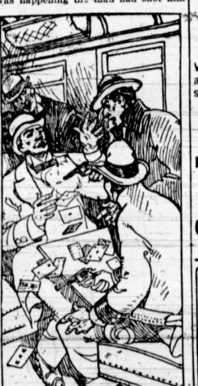
AND HERE'S ANOTHER NOT IN THE DECK.

The constable and his prisoners took the last vacant seats in the smoking car of an express train. They were in the middle of the car, and Kingston, hood, acceded to their request to travel without handcuffs.