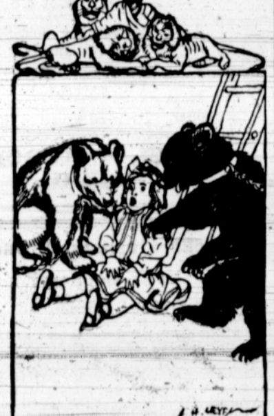
BEATEN IN THE PIT BETWEEN THE TWO BEARS.