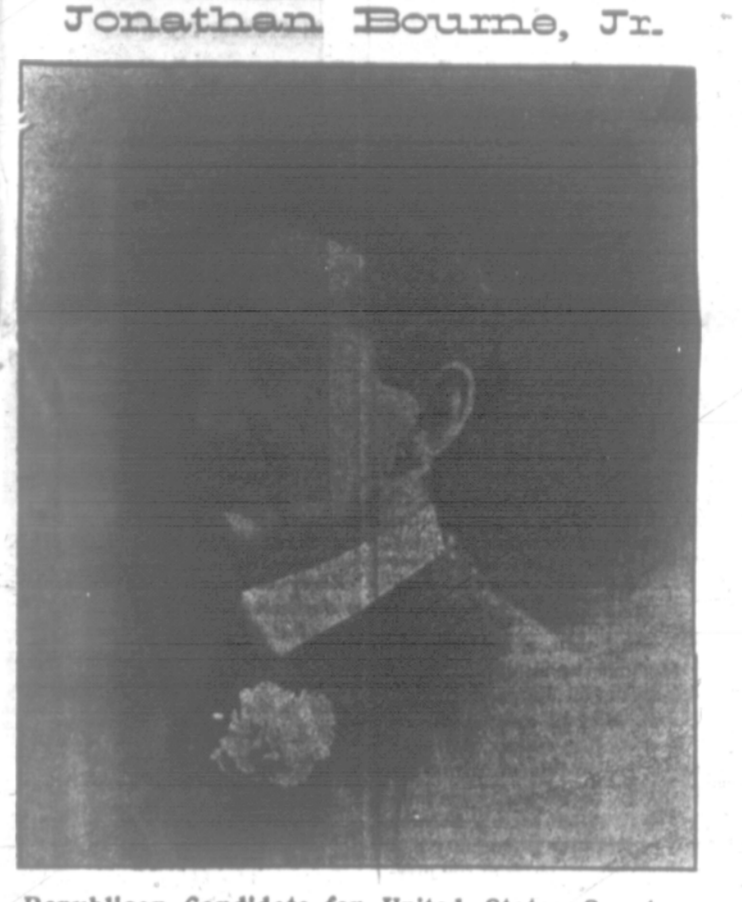
Jonathan Bourne, Jr. Republican Candidate for United States Senator. Champion of Statement One.