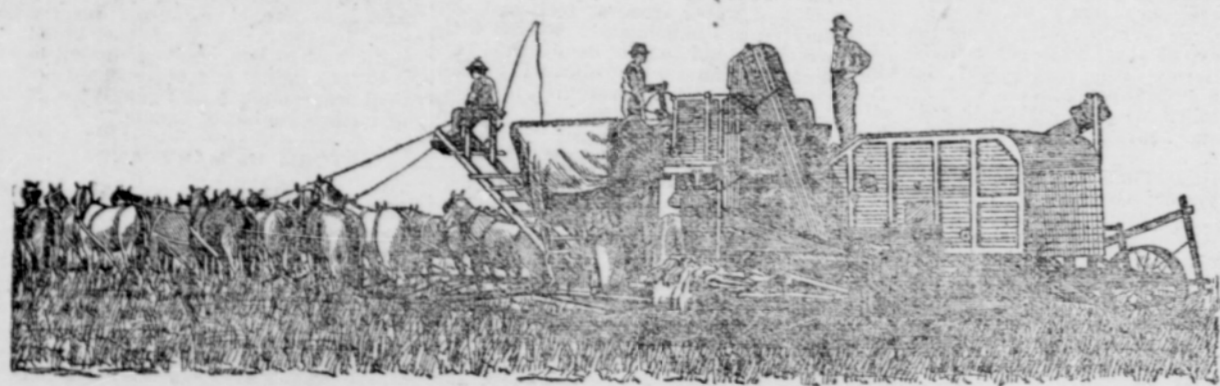
HOLT BROS COMBINED HARVESTER

Has this year, more so than any previous year, demonstrated its usefulness to the wheat growers in this locality, by saving extra expenditure of money for high priced help, saving all the grain, and putting it in the sack ready for market with one operation, and as cheap as one could otherwise head it.