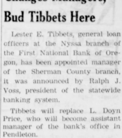
LESTER E. TIBBETS