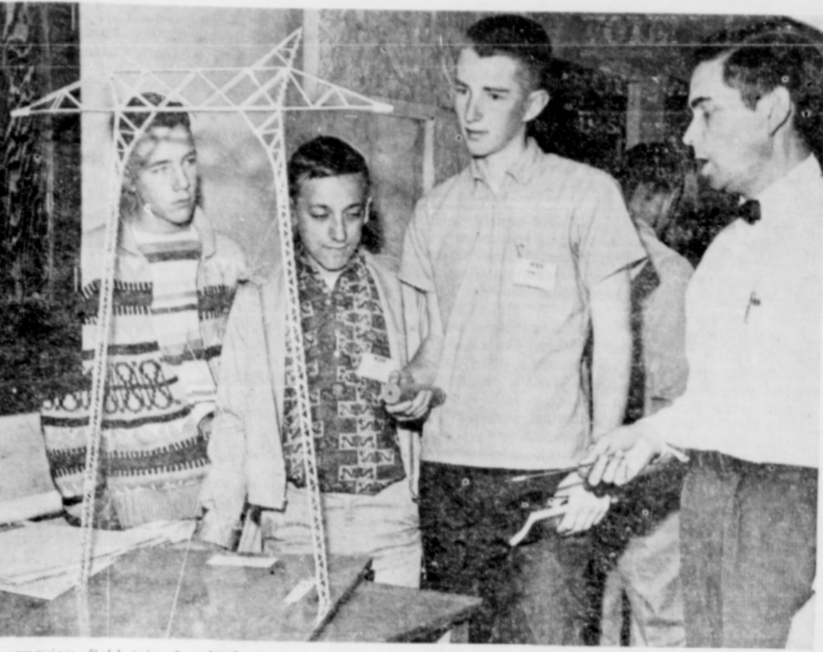
A one-day field trip for high school boys enrolled in the Junior Engineers' and Scientists' Summer Institute now in progress at Oregon State University brought nearly 200 youngsters to Portland as guests of Pacific Power & Light Company. They toured PP