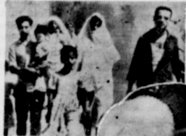
A TUNISIAN FAMILY who fled Bizerte during battle, returns home. United Nations succeeded in obtaining a cease fire.