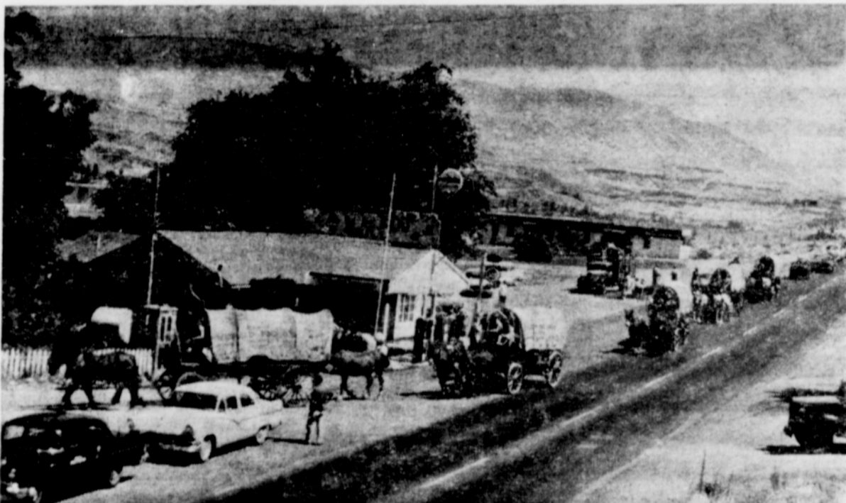
This picture of the Biggs service station that burned Monday morning was taken in 1959 when turned there to camp nearer the "Oregon Trail Calvacade" river.

The Consulting Engineers Association of Oregon has issued this new version of a state-wide public disaster map, showing new telephone numbers of disaster contact engineers in Oregon's seven districts. These engineers are members of CEAO's Public Disaster Committee, which was formed more than a year ago, following the explosion in downtown Roseburg. In event of disaster, such as fire, flood, earthquake, explosion or enemy attack, a call to the disaster contact engineer will bring immediate help to determine what buildings and utilities are safe, and for how long. This map should be saved for emergency use.