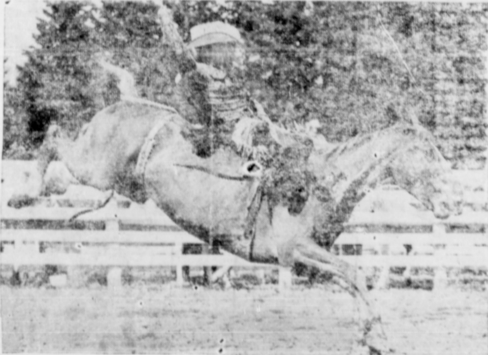
They turn the bareback horses loose because the rider rides by a handhold on the surcingle anyway. This one is really unhappy and anxious to get rid of the rider and his pesky spurs in the shoulders. They say the eight seconds a rider has to stay on a bareback horse is the longest eight seconds of a whole year and we reckon that might be right.