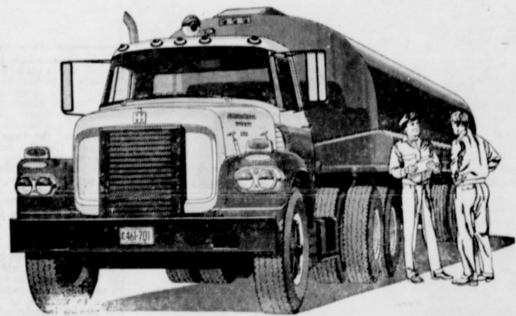
New INTERNATIONAL BC Diesel Series offers four or six wheel chassis, diesel engines from 180 to 220 hp. Bumper-to-back-of-cab dimension only 30 in.

The new compact-design INTERNATIONAL diesel permits 800 lbs. more payload using normal fifth-wheel setting. Lightweight version allows 1000 lbs.! Total payloads possible: 38,000 lbs. and more on 4x2 models! You'll save money on initial cost and over the long run. We provide expert diesel service.