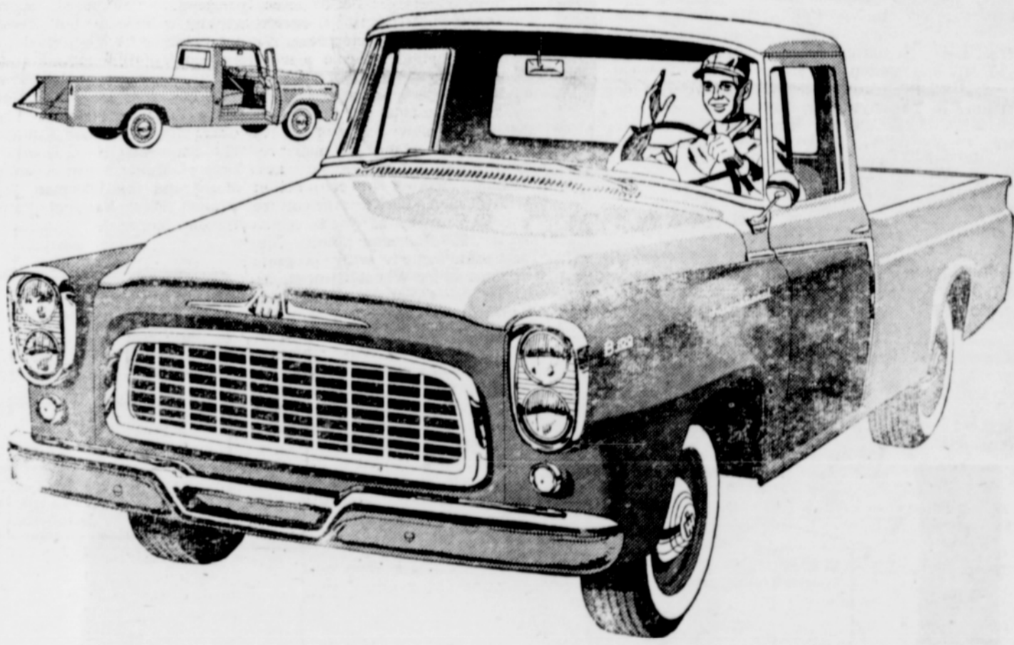
New International Bonus-Load pickups have wide body cab. Plenty of elbow room for 3 adults. New one-hand tailgate operation. Smooth lined bodies 7 or 8 1/2 ft. long.

For looks —Flush sides. Dual headlights. Sweep-Around windshield. One-piece grille. For load —75-in. wide box. Flush to cab fit. 25% more load area. For life —Stronger frames and springs than before. Truck-designed engines, "six" and V-8. The International B-100 Bonus-Load Pickup.