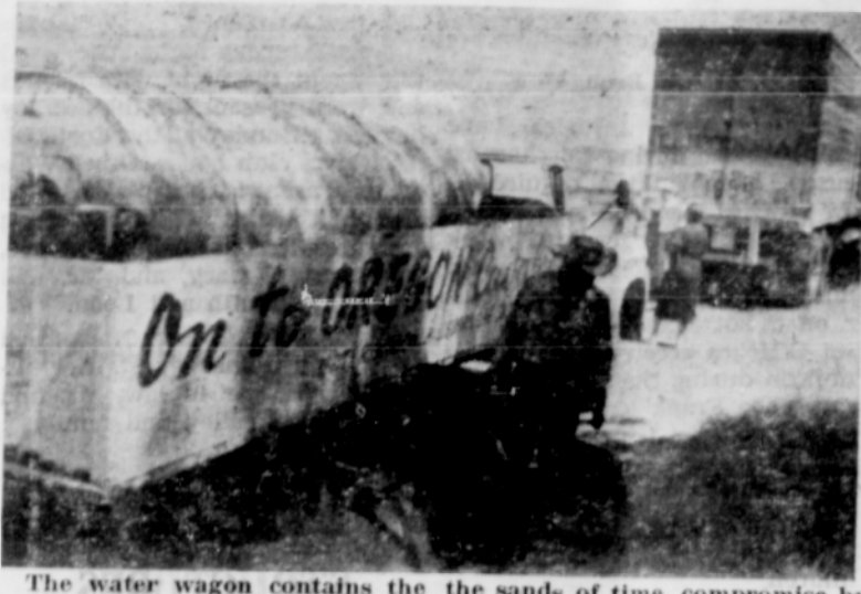
The water wagon contains the signatures of thousands of the curious who, perhaps, denied the privilege of leaving footprints in the sands of time, compromise by leaving pencil marks on a traveling wagon train.