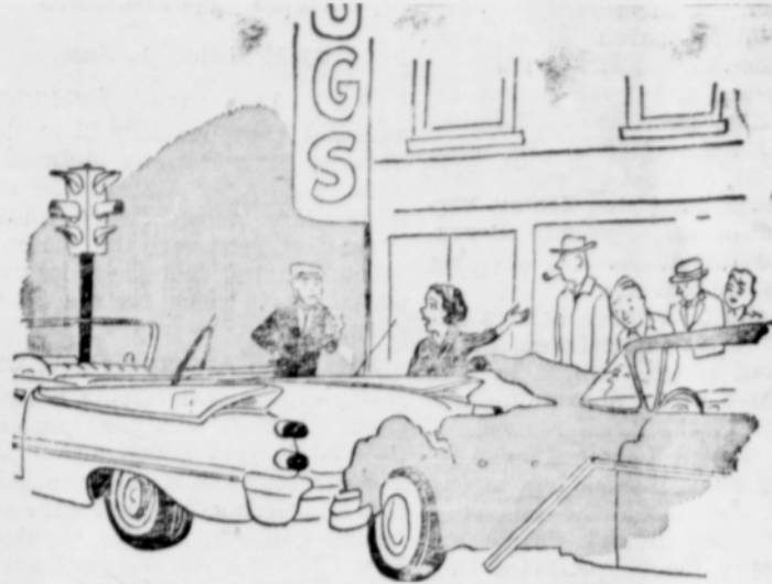
"I don't feel it's entirely my fault. The salesman said this car was fully automatic."