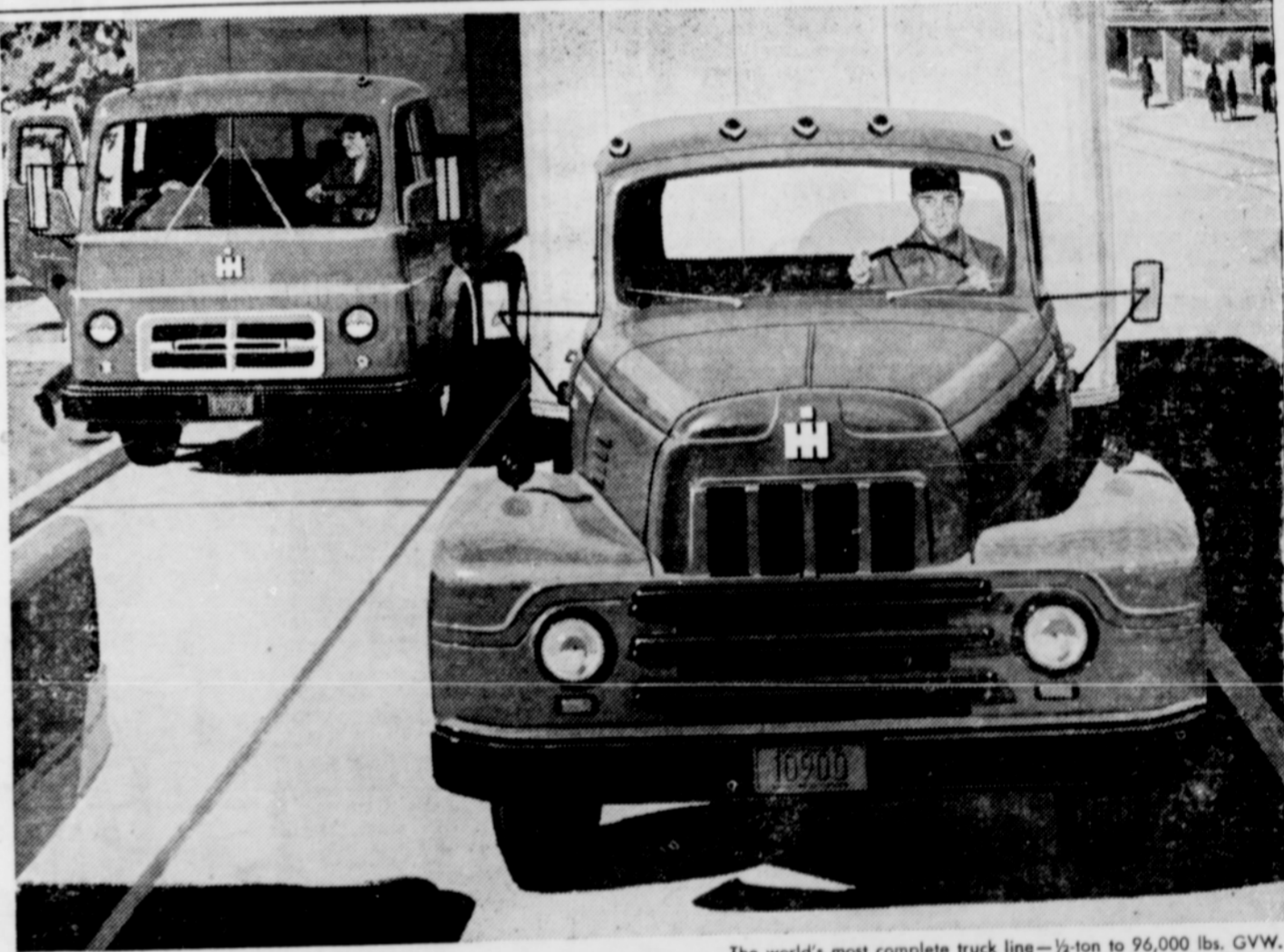
The world's most complete truck line—1/2-ton to 96,000 lbs. GVW.

COPYRIGHT 1939 BY BLITZ-WEINHARD COMPANY, PORTLAND, OREGON