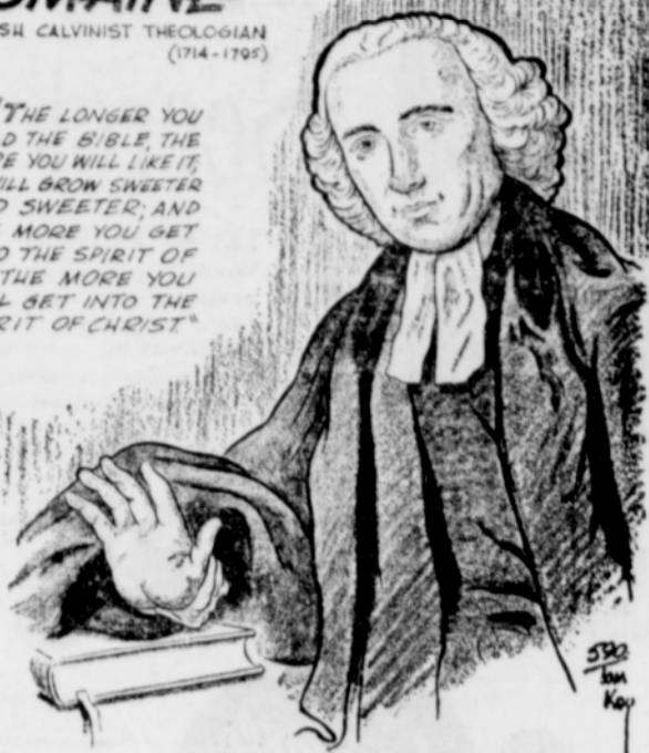
THE BIBLE: The More Read, The Better Liked

"THE LONGER YOU READ THE BIBLE, THE MORE YOU WILL LIKE IT, IT WILL GROW SWEETER AND SWEETER, AND THE MORE YOU GET INTO THE SPIRIT OF IT, THE MORE YOU WILL GET INTO THE SPIRIT OF CHRIST"