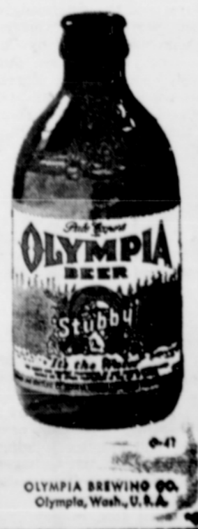
OLYMPIA BREWING CO. Olympia, Wash., U.S.A.

the one priceless ingredient "It's the Water"