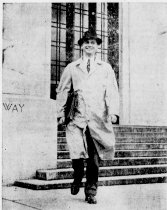
MARK HATFIELD brings to Oregon a new brand of statesmanship. It's leadership with hustle ... a program of action . Let's wipe out the past two years of confusion. Let's get Hatfield and get GROWING!