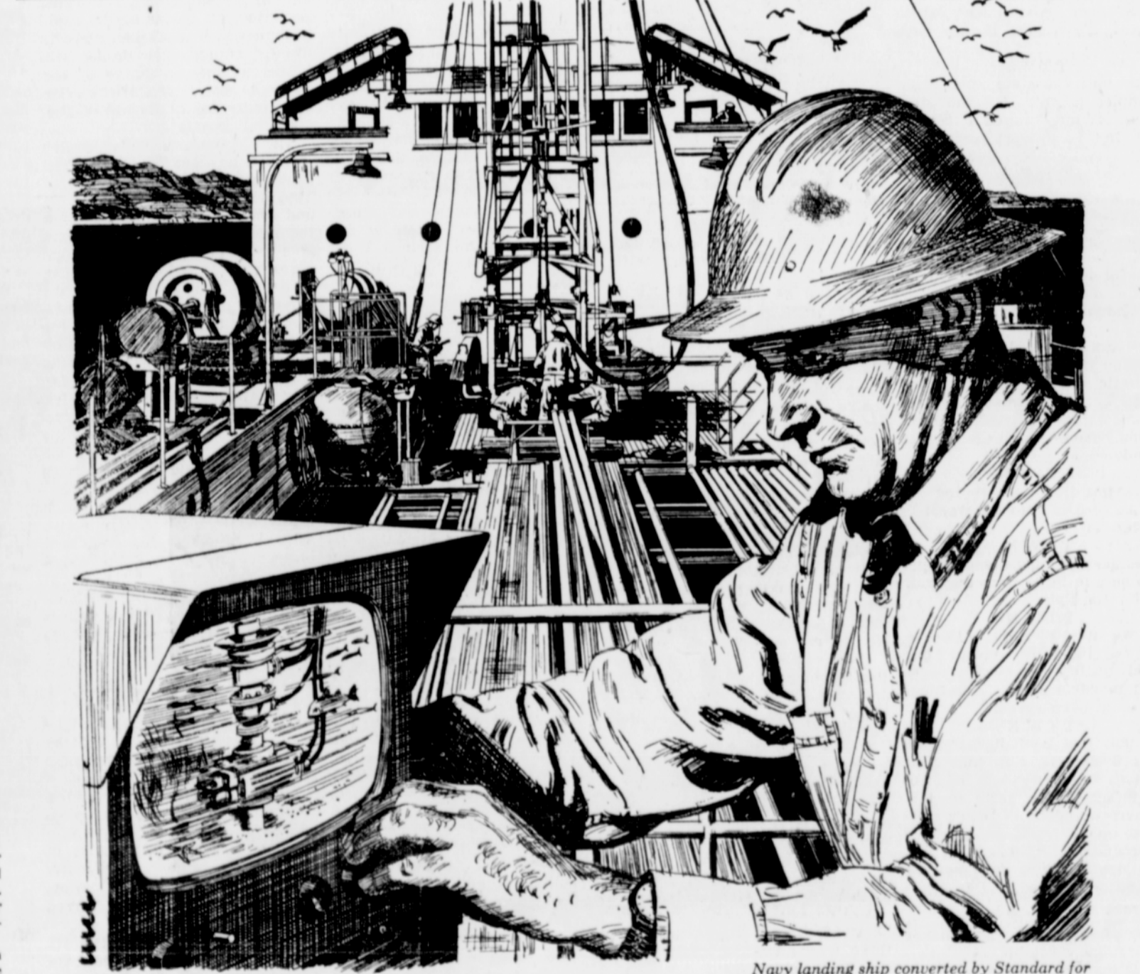
Navy landing ship converted by Standard for off-shore oil search. A 55-foot drilling mast is poised over circular 10-foot-wide opening from deck through bottom.

What a comfort it is to have a telephone at your bedside. It gives you a feeling of security to have a phone within your reach. And when it rings you can just reach out and answer it! A bedside phone adds beauty to your room, too. You choose from nine decorator colors. And the cost is low. Just $1.25 a month after a one-time installation charge. So call our business office now! Pacific Telephone