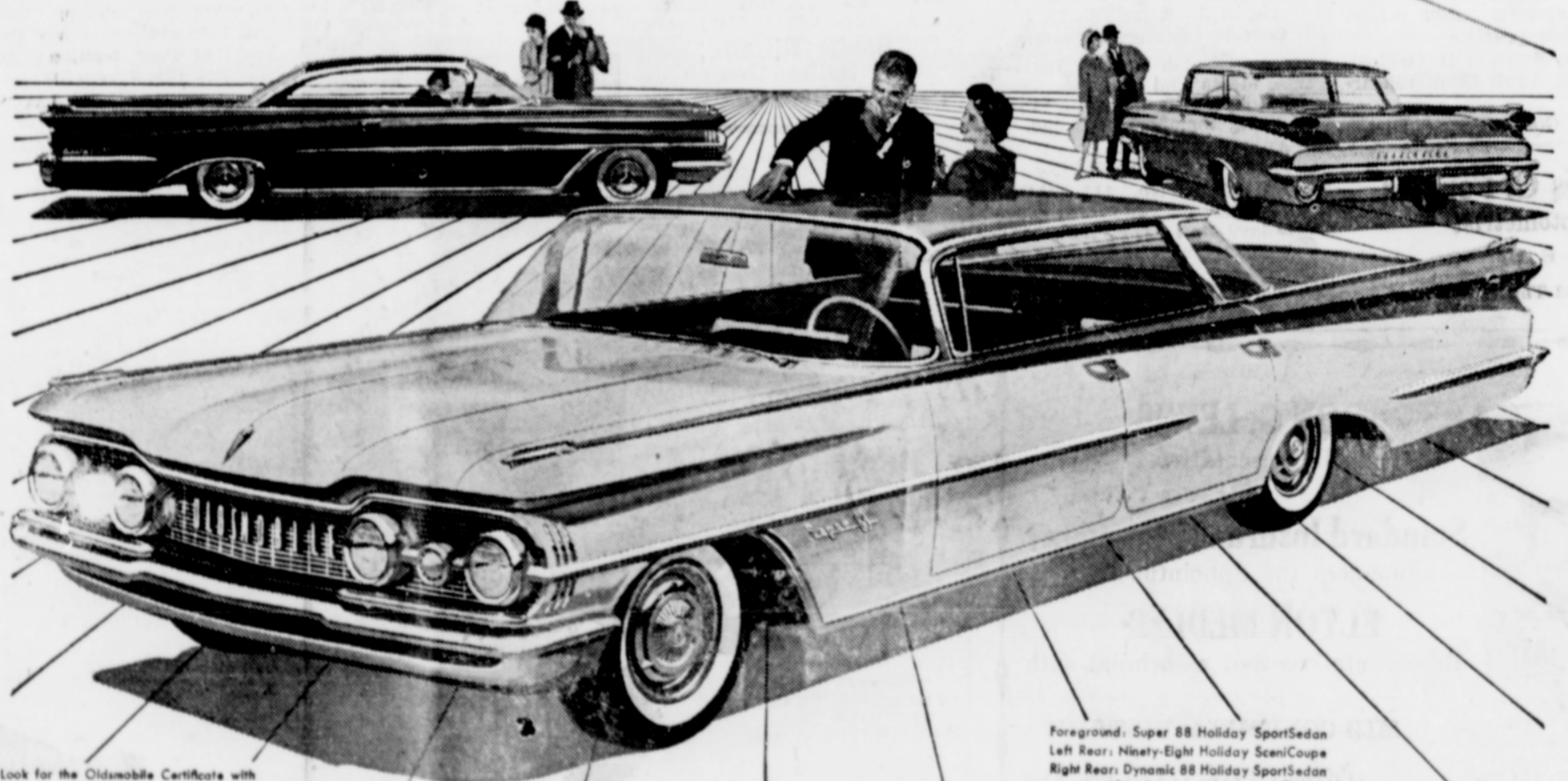
Look for the Oldsmobile Certificate with complete suggested retail prices on every '59 Olds.