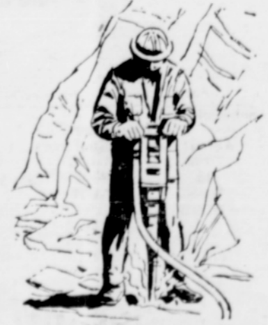
$18 million in paychecks this year

At home and on the job, make full use of your low-cost PP & L electric service. It's today's biggest bargain!