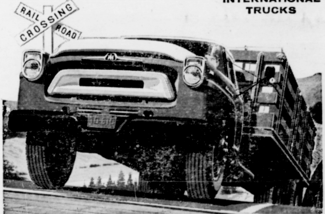
The world's most complete truck line—1/2-ton to 96,000 lbs. GVW.

INTERNATIONAL TRUCKS cost least to own! CUSHMAN EQUIPMENT COMPANY Moro, Oregon Phone JO 5-3555