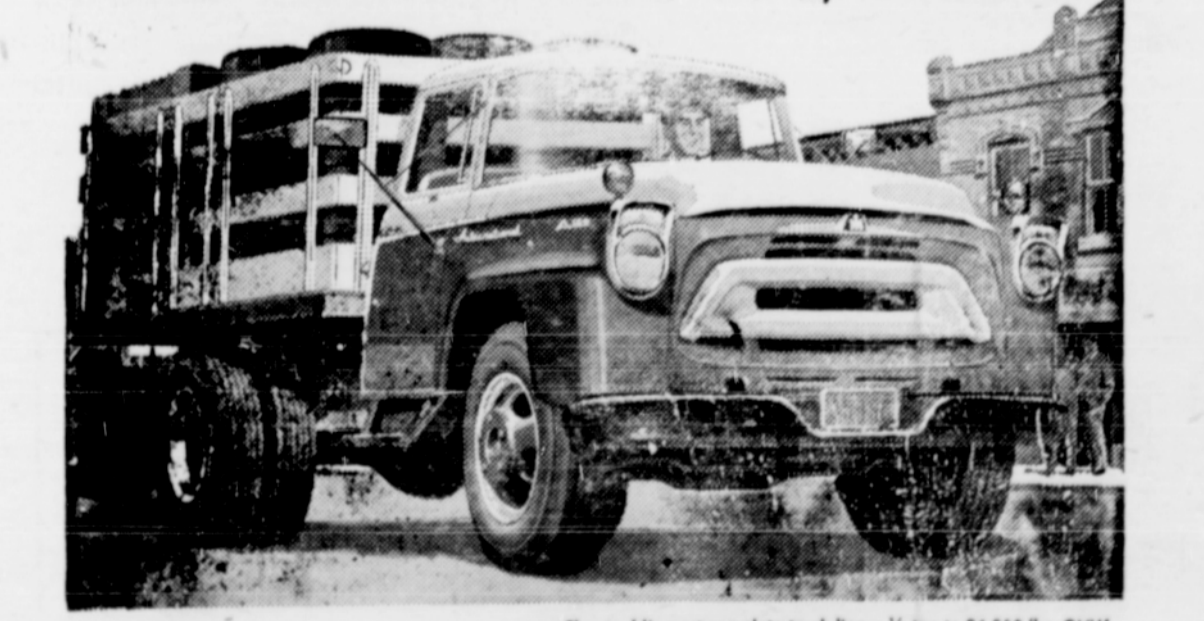
The world's most complete truck line — 1 1/2-ton to 76,000 lbs. GVW.

INTERNATIONAL TRUCKS cost least to own! CUSHMAN EQUIPMENT COMPANY Moro, Oregon Phone JO 5-3555