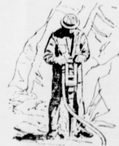
$12 million in paychecks this year

PP&L's record construction program means more power for Pacific Powerland. It also means $18-million in construction jobs and paychecks this year. Three major PP&L projects will add 350,000 kilowatts of new power to the Company's system this fall. More power for industrial payrolls! More power for your comfort and convenience! At home and on the job, make full use of your low-cost P P & L electric service. It's today's biggest bargain!