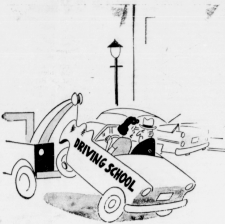
"Does This Mean I've Flunked?"