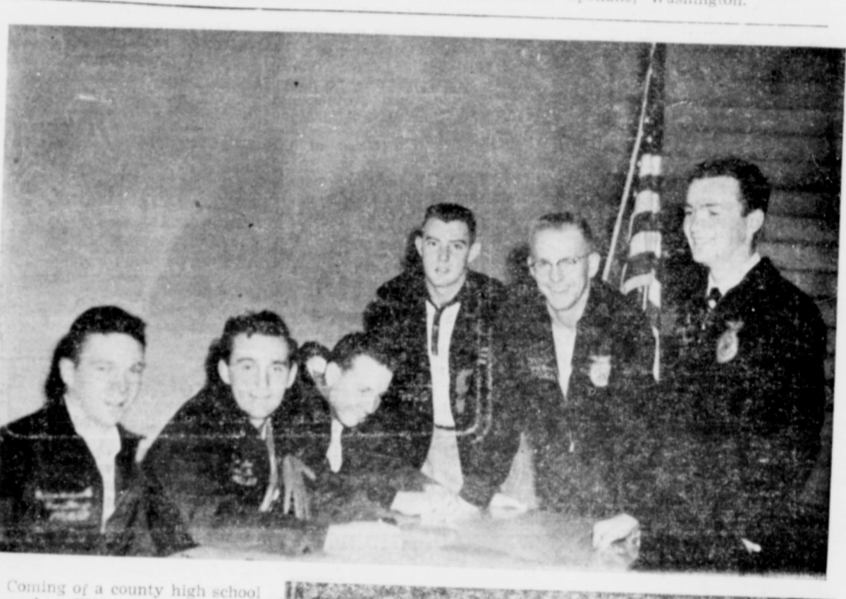
Coming of a county high school brought a FFA chapter with newly elected officers and an agricultural instructor for the first time in history.