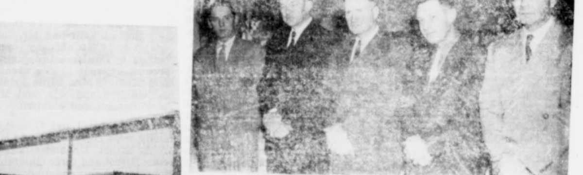
Future Farmers of America is the organization that goes along with Smith-Hughes work in high schools. Students will learn about farm machinery, about stock judging, carpentry and will also get some training in public speaking and group organization before they finish their high school course.