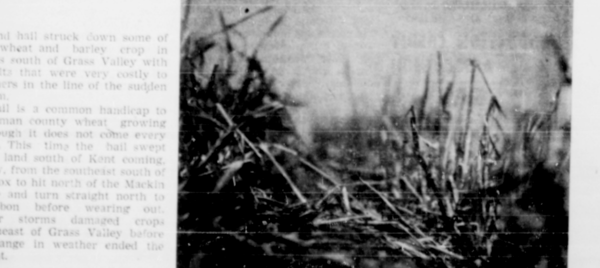
And hail struck down some of the wheat and barley crop in field south of Grass Valley with results that were very costly to farmers in the line of the sudden storm. Hail is a common handicap to Sherman county wheat growing although it does not come every year. This time the hail swept over land south of Kent coming south, from the southeast south of Wilcox to hit north of the Mackin place and turn straight north to Bourbon before wearing out. Other storms damaged crops southeast of Grass Valley before a change in weather ended the threat.