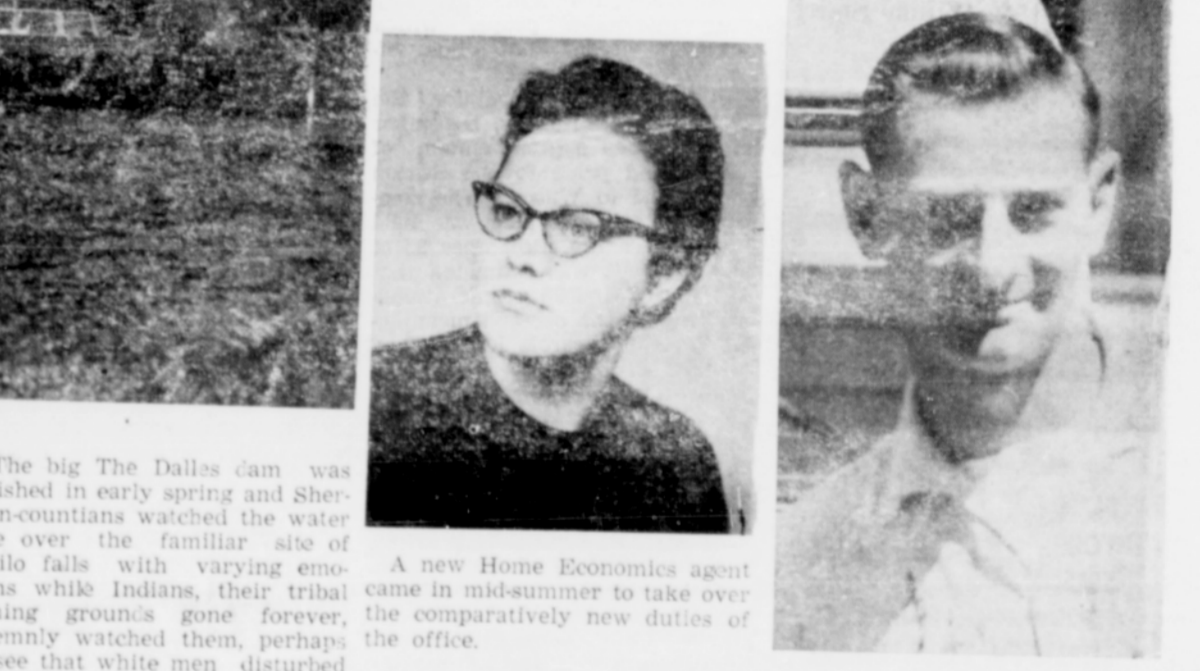
A new Home Economics agent came in mid-summer to take over the comparatively new duties of the office.