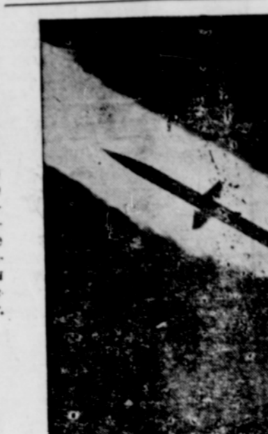
ANTI-AIRCRAFT missile, the Navy's "Terrier," is one of a family of defensive missiles, including the Army's "Nike," which could be put into action if the nation's warning system indicated the approach of attacking planes. Primary purpose of these missiles at such a time would be to protect the nation's 92 critical civil defense targets from as many attackers as possible. The "Terrier" is shown silhouetted against the booster blast of another missile during firing practice aboard the USS Mississippi.

EGG PRICES ARE NOW IN SPOTLIGHT Egg prices are expected to advance more than usual this fall