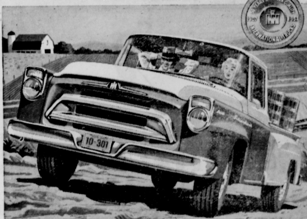
New Golden Anniversary INTERNATIONALS range from Pickups to 33,000 lbs. GVW six-wheelers. Other INTERNATIONALS, to 96,000 lbs. GVW, round out world's most complete line.

There's a look of action in every fresh, clean line of the new Golden Anniversary INTERNATIONAL Trucks. And there's a feel of comfort that's hard to believe.