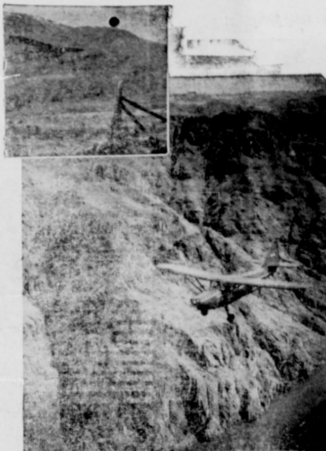
The southeast corner of the River Canyon (shown here) is one of the most remote and least settled parts of the Pacific Northwest.

First & Madison - The Dalles, Ore. Phone CY6-2297