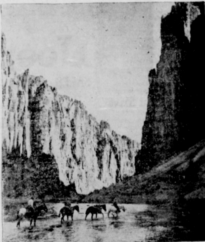
Pasture hopping mail along on Snake River. (Lower Grand Canyon)

Streets in Moro were improved this week. In one way by the construction of a tile retaining wall on First street alongside the Richfield station and in another by the removed of some locust stumps on Main street between First and Fourth which Marshal Cochran burned out preparatory to paving the strip between the curb and the walk.