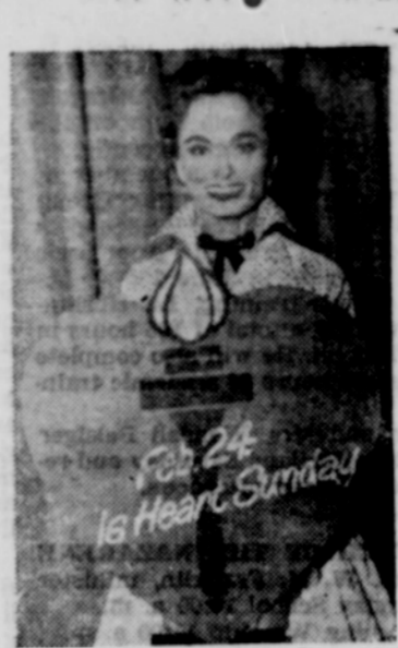
TIMELY REMINDER is offered by Film Star Ann Blythe, who urges you to welcome your Heart Fund volunteer on Heart Sunday, February 24.