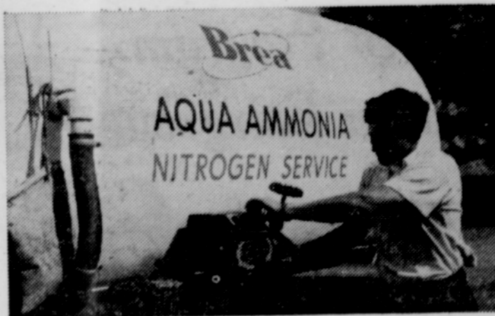
OUR MECHANIZED FIELD-SIDE SERVICE saves you manpower and equipment time on storage, handling, hauling and applicator loading.