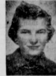
by FRANCES FIELDS Home Economist Oregon Wheat League Lewis Building Portland 4, Oregon

A very familiar cry in American families. At picnics, parties, mealtime... particularly during the summer months, sandwiches just fit the bill. There's economy, ease, versatility and good taste in sandwiches. Especially when the flour blend includes fine Oregon soft wheat. Sandwiches made from enriched bread are high in nutritive value, too, and are so easy to prepare.