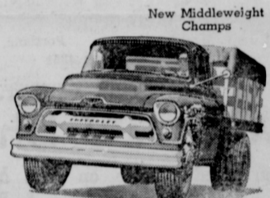
New Middleweight Champs

High-powered V8's—standard in heavy-duty jobs! You get the big new 322-cu.-in. Loadmaster V8 in 9000 and 10000 series trucks. The Taskmaster V8 is standard in other L.C.F. and heavy-duty models. In lightweights and most middleweights, V8's are extra-cost options.