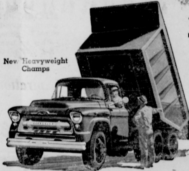
New Heavyweight Champs