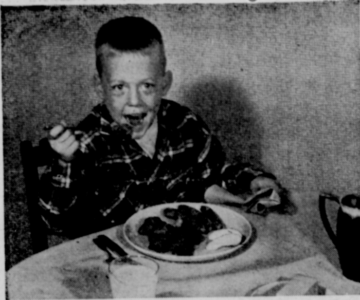
Have a breakfast problem at your home? Your whole family will dig in like this young fellow if you serve Apple-Raisin Fritters and pork sausage. Add fresh apple slices for a combination that's both appealing and nourishing for winter breakfasts.